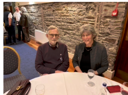
75% of The Kinsale Warblers in St John's for their annual concert (pictured left)