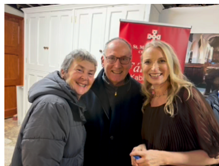
You meet all sorts in St Multose!