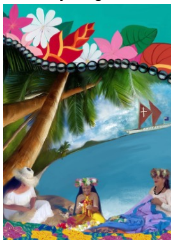
Cook Islands Artwork for World Day of Prayer 2025