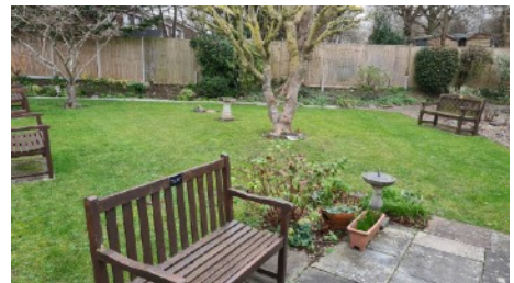
Photos include Doves of Peace & a Garden of Remembrance