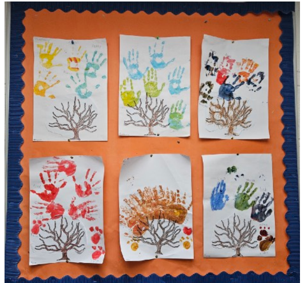
Artwork at St Multose National School

This year our annual Easter Vestry will be held on Sunday 14 April during a united service at 11.30am in St. Multose, Kinsale. Over the coming weeks, the church wardens will have the forms that you can fill out if you are a new member to our church family and wish to be added to the vestry list. Existing members can also use this opportunity to update their contact details or addresses. The churchwardens in each church will be able to answer your questions and explain the Easter Vestry to anyone who wishes to know more.